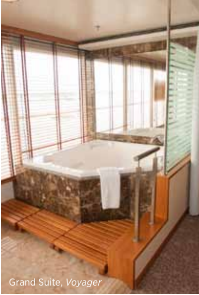
Grand Suite, Voyager