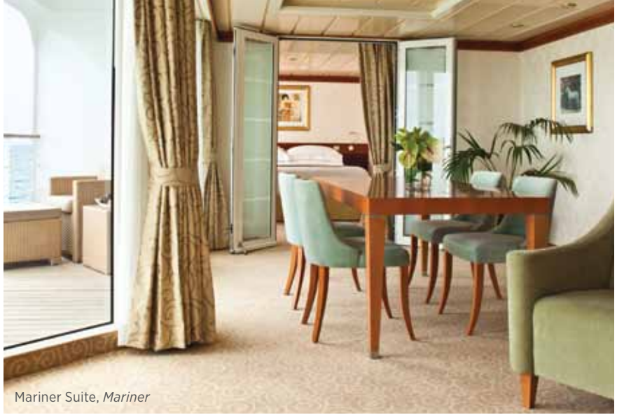
Mariner Suite, Mariner